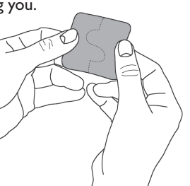
4. Bend the patch in half so that the S-shaped